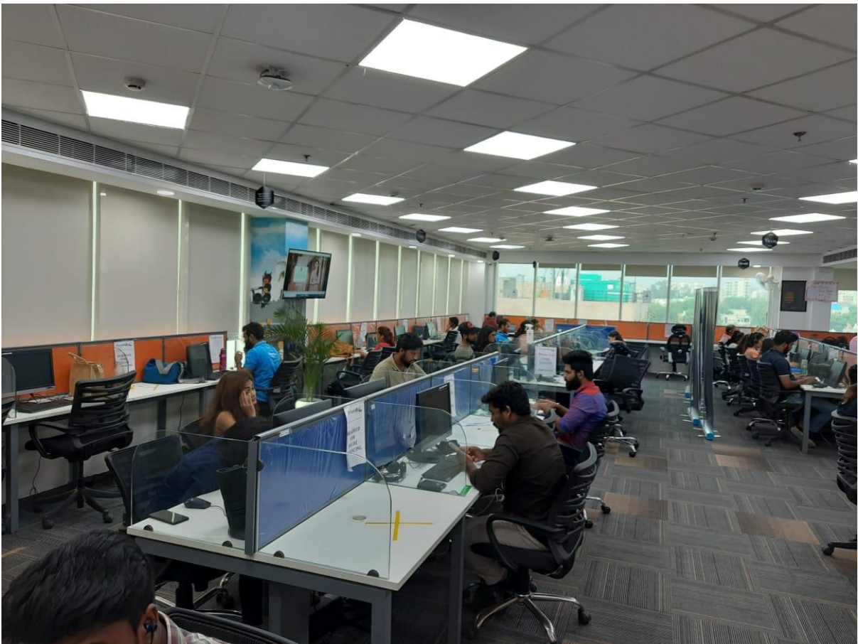
View - 2